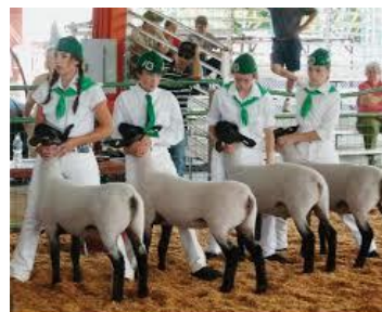
Participants in the Shasta County 4-H program exhibit their project results at the Shasta District Fair.

Fairs provide opportunities for members to exhibit the best of their project work from the past year and see how their skills have grown. Fairs also share with the community what UC 4-H activities are taking place in their area. Each fair is governed by a set of rules that should be carefully reviewed by UC 4-H staff. Most fairs are not run by UC 4-H. Entering UC 4-H projects in county, district, and state fairs is the responsibility of the UC 4-H members. They should contact their project leaders to obtain necessary forms, help with completion of forms, and required signatures. Members are responsible for turning in their entries on time. It is the member's responsibility to find out the rules of a fair and follow them, while representing UC 4-H and following UC 4-H Code of Conduct. See more information about UC 4-H and fairs online at http://4h.ucanr.edu/4-H_Events/CountyFairs